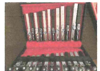
Hand Bells and Tone Chimes found in rectory attic